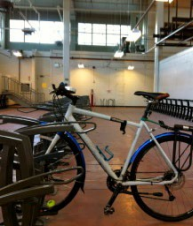
Yoga for Cyclists