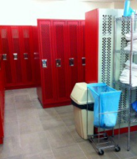
Towels & Lockers